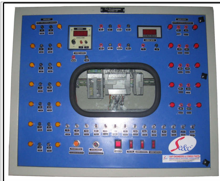
PLC PROGRAMMING TRAINER KIT

The applications and working modules of PLCs which are optionally hooked up with PLC Programming Trainer Kit (PCST – 14) gives an idea regarding the basics of Programmable Logic Controllers & its applications.