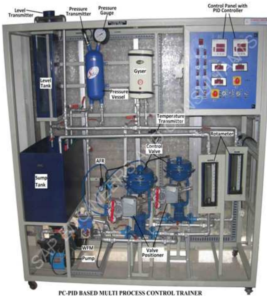
PC-PID BASED MULTI PROCESS CONTROL TRAINER

The PC-PID Based Multi Process Control Trainer (PCMT - 01) is highly flexible and modular system for studying of various control loops in industrial processes. It has been designed to include these processes in a single structure. The system in fact includes transducers, transmitters, PID controllers, actuators, + computerized control with SCADA application Software.